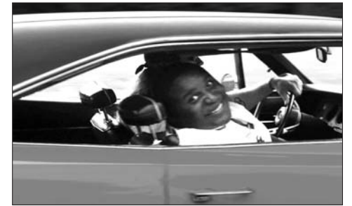
"Darius Goes West."