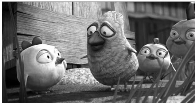
A contemporary update of Hans Christian Andersen's fairy-tale includes top-notch 3-D animation.