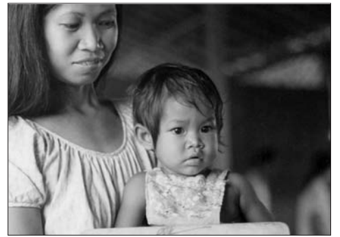
"New Year Baby."